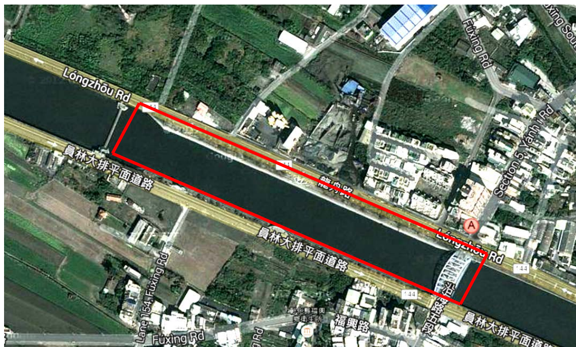
Fu-Lu River, Lu Kang Township, Changhua County