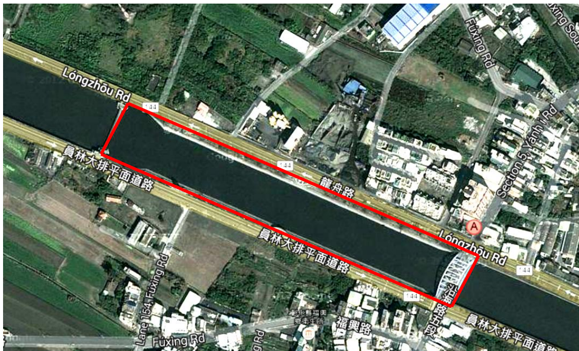
Fu-Lu River, Lu Kang Township, Changhua County